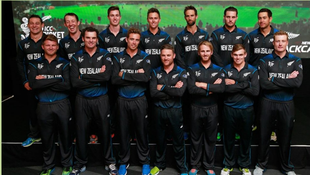
NZ Black Caps- Best cricket team in the World Cup!