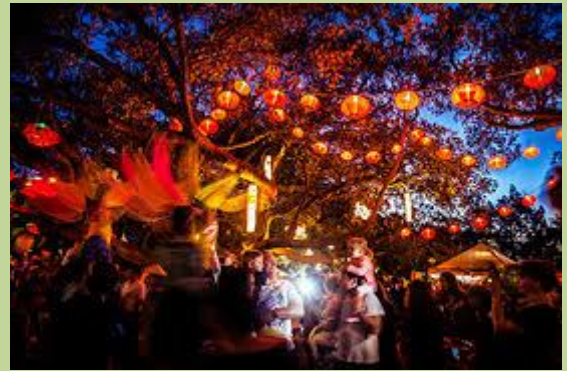
Chinese Lantern Festival