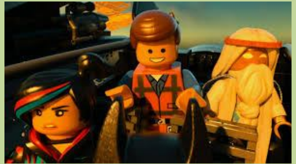
The Lego movie

Have a great break, don't stress, don't work too hard and take time to smell the roses. (The Parnell Rose garden is the best for that!)